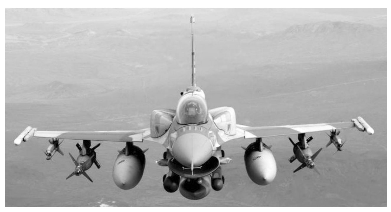
F-16I. Note the conformal tanks at the wing roots.

Israeli extranational (US) reinforcements are listed on page 11, defined as part of the United States' actions as an ally.